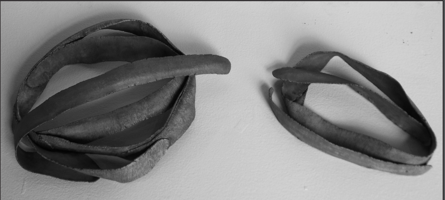
"Trail #7" by artist Yoko Haar

THIS PROGRAM IS SUPPORTED IN PART BY THE STATE FOUNDATION ON CULTURE AND THE ARTS THROUGH APPROPRIATIONS FROM THE LEGISLATURE OF THE STATE OF HAWAII AND BY THE NATIONAL ENDOWMENT FOR THE ARTS. GRANTS FROM THE HAWAII COMMUNITY FOUNDATION, MCINERNEY FOUNDATION, AND THE ATHERTON FAMILY FOUNDATION ALSO PROVIDE PARTIAL FUNDING FOR THIS PROGRAM.