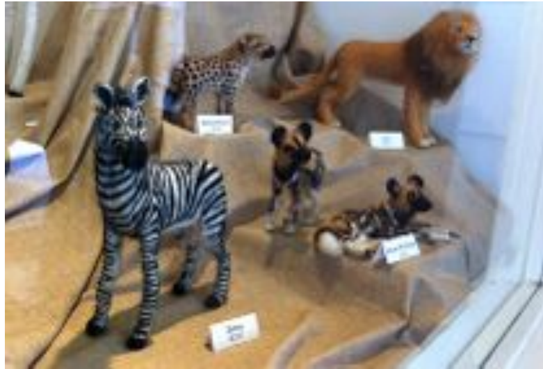
July Window: Felting by Liza Hamilton

The Window is a wonderful mini-exhibition gallery space in the ARTS at Marks Garage, available to all Hawai'i Craftsmen members for month-long displays. The window is approximately 4'H x 6'W x 2'D. Contact Hawai'i Craftsmen ( info@hawaiicraftsmen.org ) for more information.